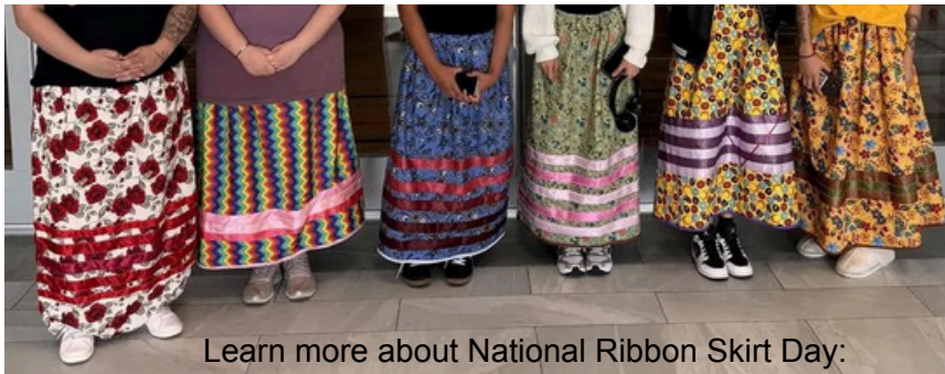
Learn more about National Ribbon Skirt Day: