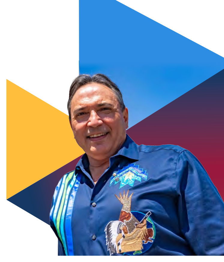
Jada Yee